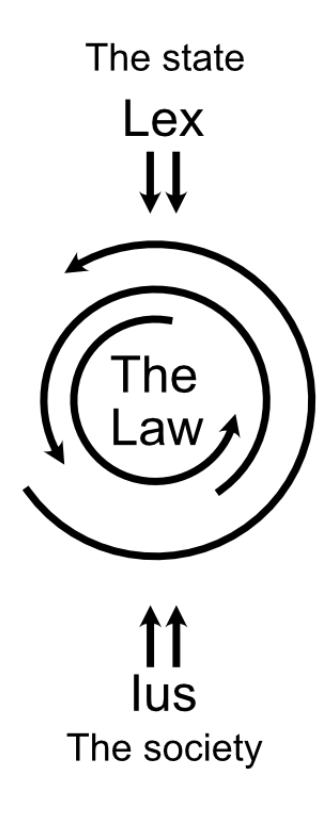
Figure 1: Legal Discourse

Ius describes the parts of 'The Law' which arises from the culture, becoming something more than etiquette or cultural rule. Ius is unwritten constitutional principles, what is 'right', what is straight, the way of the world, and the way things should be. Ius is cultural norms which have transcended past norms of religion and etiquette and become broadly binding in the minds of the people. Ius is fairness, and principles of fundamental justice, Ius Gentium, the casuistic private law binding the interactions between people without outside enforcement. Ius is primary rules and the rule of recognition. Ius is that which people willingly choose to follow. Ius is human rights, civil rights, and wearing clothes in public. Ius is the aspect of law which emerges from primordial soup of culture. <sup>11</sup>